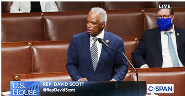
CORONAVIRUS EMERGENCY AID | HOUSING ASSISTANCE

And, I sponsored H.R. 6729, the COVID-19 Homeowner Assistance Fund Act of 2020 , establishing a $175 billion fund to help homeowners and renters pay their mortgages, rent, and their water, electricity, and gas utility bills.